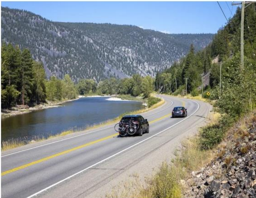
The east-west Crowsnest Highway stretches 1,161 kilometres from Medicine Hat to Hope, B.C.

Robin Brunet • Postmedia Content Works Apr 18, 2022 • April 18, 2022 • 2 minute read